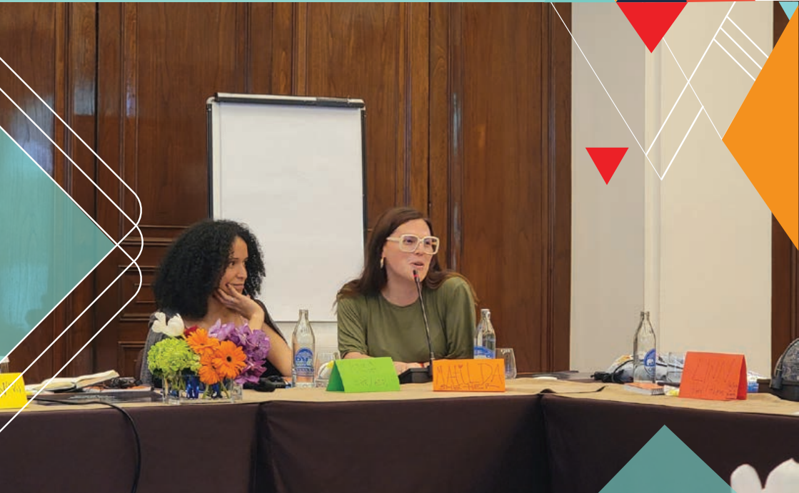
GMP In-person Meeting (June 2023)

The ITF is no longer accepting applications via our email address. In order to be considered for a grant, you must apply via the grants portal. If you are having difficulty, please reach out to info@transfund.org