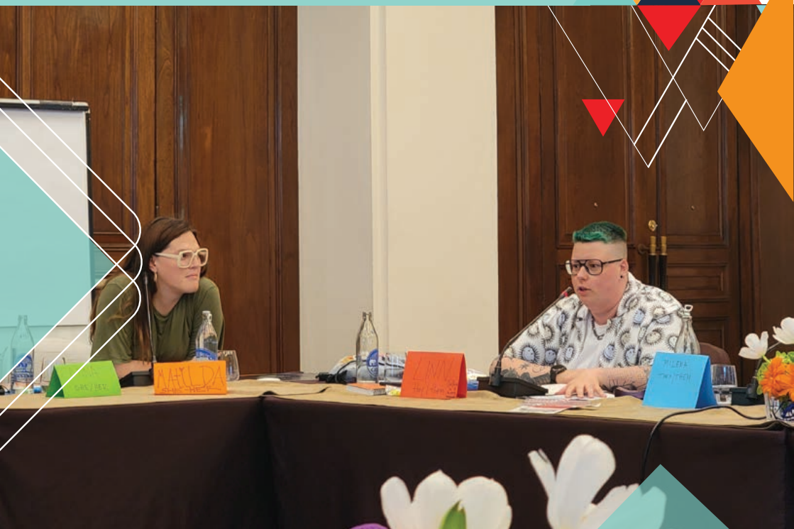
GMP In-person Meeting (June 2023)