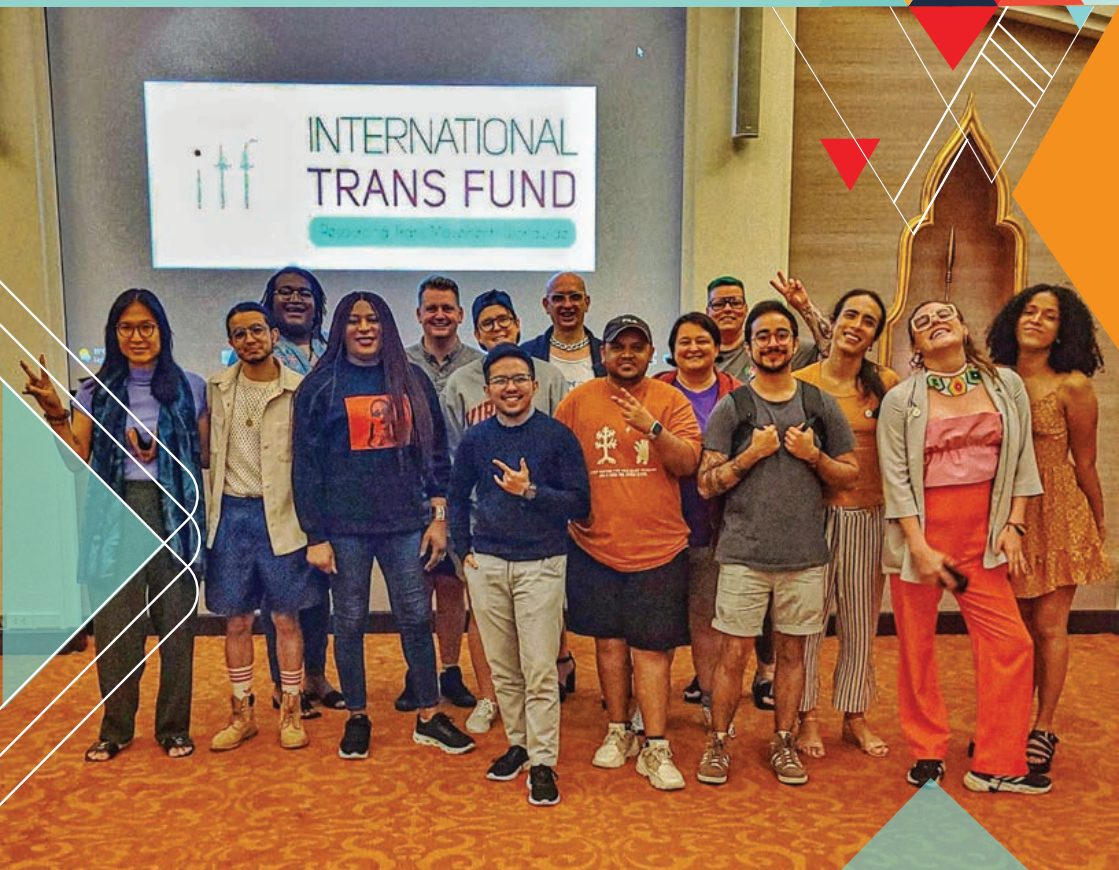
GMP In-person Meeting (June 2023)