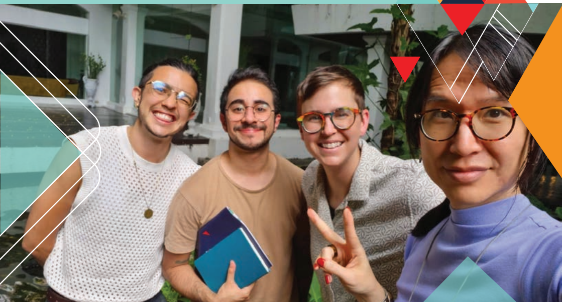
GMP In-person Meeting (June 2023)